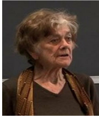
Richard Andrew Cloward and Frances Fox Piven

anything to do with that organization, and his campaign called the charges of his membership “a crack-pot smear.” No one in the mainstream media will touch the story.