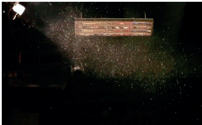
The "Glory Cloud" at Bethel Church, Redding, California

Most of the teaching and preaching at Bethel Church, as at all the "river churches," centers on alleged signs and wonders, and little on reliable teaching of God's Word. What truths they share are milk, with little or no meat to accompany them.