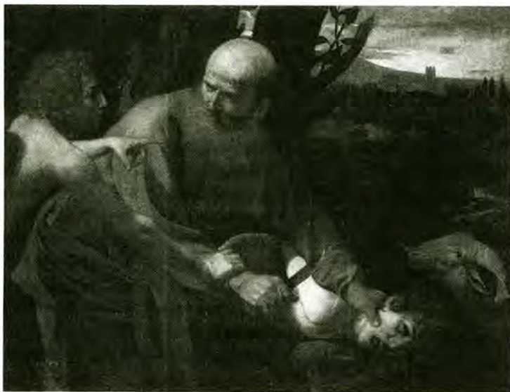
Sacrifice of Isaac by Caravaggio 1603. the Uffizi Gallery, Florence, Italy

tory bears out the evil that came through Ishmael's seed—an evil that has warred against God's people almost from the beginning. Ishmael is credited with being the patriarch of today's Arabs. His mother Hagar was an Egyptian, as was his wife. Thus, the Arabs, both Christians and Muslims, rightly look to Abraham as their father. But the anti-Christ spirit throughout the millennia pitted Abraham's children by Hagar against his children by Sarai, the latter being the heirs to the promises of God.