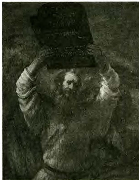
Moses with the Tablets of the Law by Rembrandt

More important, they were looking for a god to lead them back to Egypt. Thus, they formed a golden calf. In Egypt, Pharaoh was worshiped as a god, symbolized